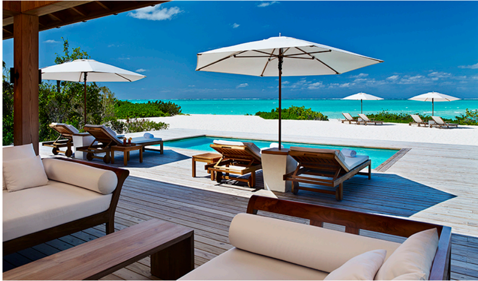
COMO Parrot Cay.

boat. One of our favorite all-inclusive perks: All guests gather in the intimate Great Hall to dine together in proper fashion, just like the Rockefellers would have done.