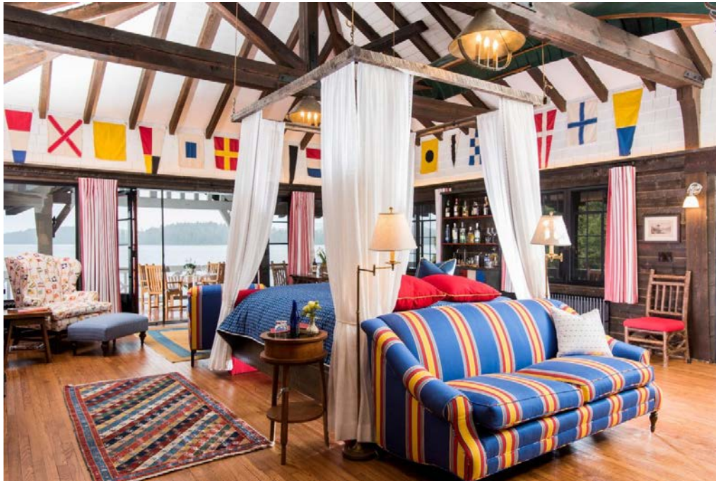
The Point.

By Forbes Travel Guide Editors APRIL 10, 2018