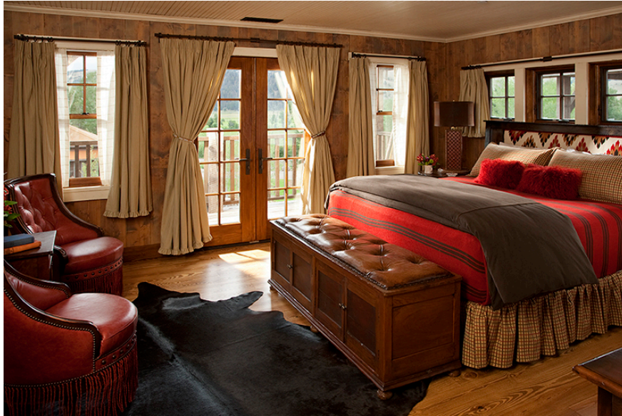
The Ranch at Rock Creek.

If a romantic hideaway in a secluded setting is what you search for in an all-inclusive escape, then look no further than this rustic Five-Star retreat in Southern Vermont . Spread across 300 acres of verdant forest, Twin Farms offers 20 cozy rooms and cottages, personally tailored meals and everything you need to enjoy the great outdoors with your travel companion, be it a canoe for a day floating around Copper Pond or a fanny pack stuffed with sunscreen for your afternoon hike.