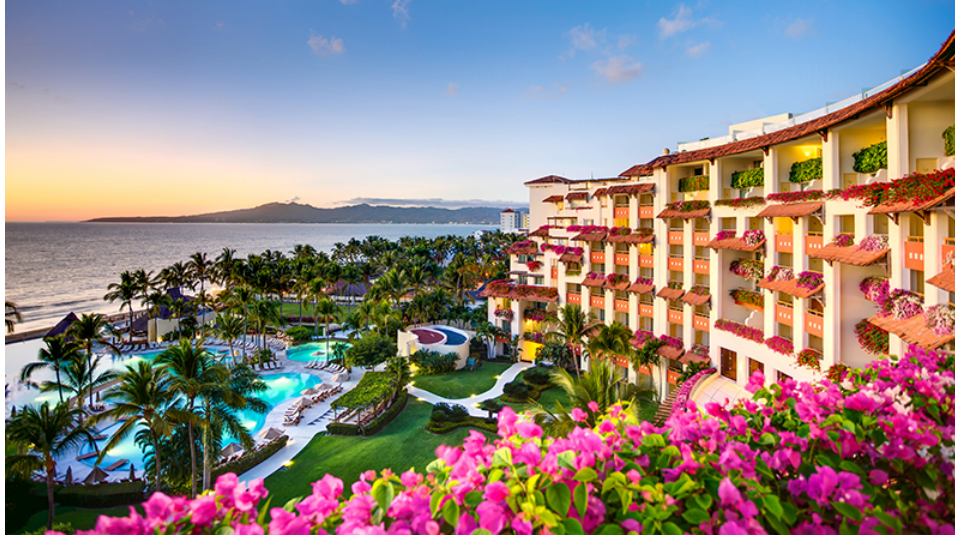
Grand Velas Riviera Nayarit.

And don't even waste your time trying to remember a prior trip where you had so many outdoor activities — we're talking everything from fly fishing and clay shooting to mountain biking and horseback riding — included in your package because it likely never happened before your visit to this Five-Star ranch.