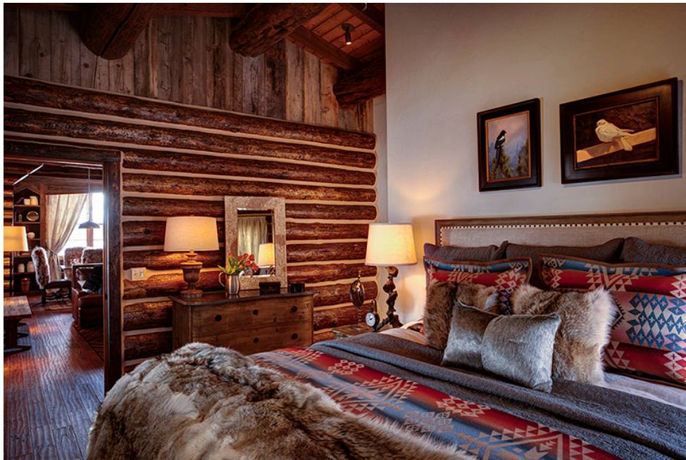
Magee Homestead.

They are likely drawn to the recently renovated hotel's bright, breezy and modern accommodations with Indonesian-influenced décor; villas that come with their own pools and 24-hour butler service; the impressive destination spa (a must for yogis); a pristine beach; and organic, fresh cuisine (using produce grown on the island) at every restaurant.